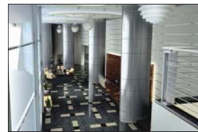
A NAIOP build-to-suit of the year, this 500,000 sf. beverage processing plant was designed as a state of the art production facility that could also serve as a stylish and elegant headquarters for its corporate staff.

For every project, we bring together top professionals in each critical area of development to assure optimal design/construction quality and increased operational efficiencies in the industrial facilities we build.