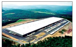
One of the world's largest consumer products companies engaged First Industrial to develop this 1.7 million sf. distribution center, a facility that became the largest single-story structure in Pennsylvania.

National buying power assuring competitive pricing on labor and materials.